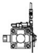
Sluice Header Actuator Assembly